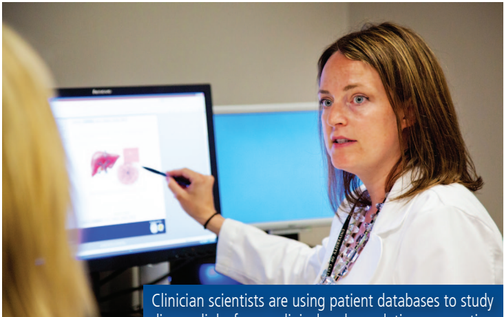
disease links from a clinical and population perspective